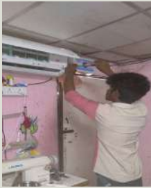
Lispan J Electrical&AC Wiring New Tech Services AC Technician Salary:10,000